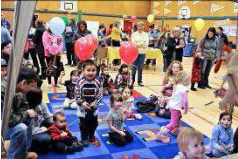
Sir Read A Lot @ Family Fest 2012